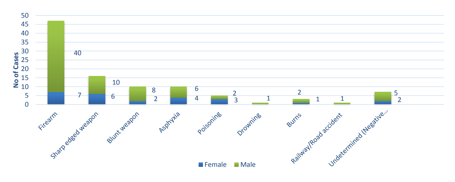
Figure 4: Kind of Weapons / Force used to cause the death

Excessive use of firearms has been explained as an indicator of the high socioeconomic pattern of the society where expensive weapons could be easily purchased while fatalities through stabbing are attributed to lower socioeconomic areas. The use of firearms has been a source of power as well as means of pleasure & punishment; it has been a cause of grief & sorrow. Firearms are involved in almost 2/3<sup>rd</sup> of all homicidal deaths in United States of America.