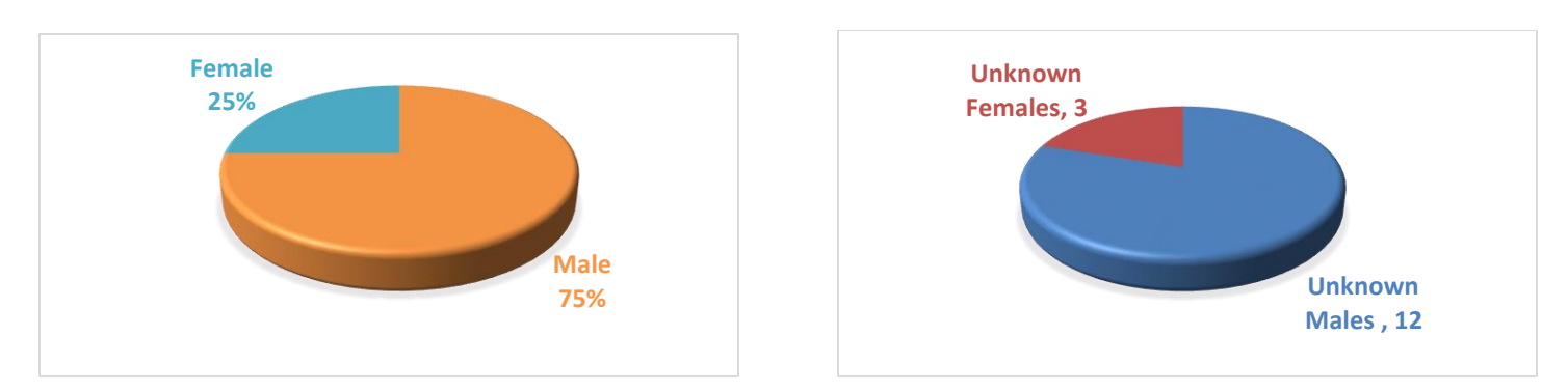
Figure 2: Demography